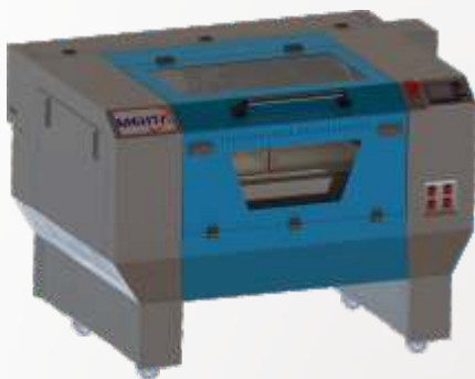
← Eva 21 Eva 32 →