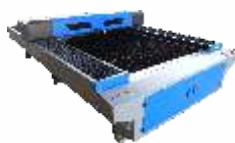
Laser Cutting Machine ELITA 480 (4 ft. x 8 ft.)