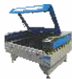
Laser Engraver ELITA 43/32/21