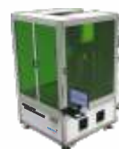
Fastest Laser Engraver ERINA 250